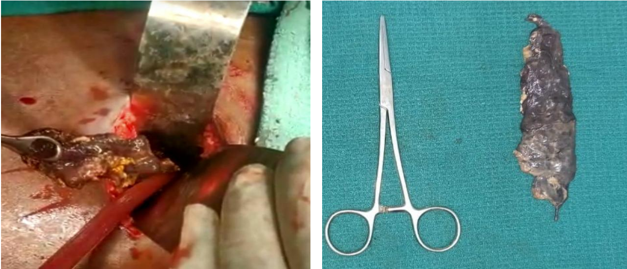
Figure 1,2. Collection and necrosectomy was performed with ring forceps and a suction device