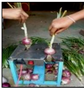
Fig .3: Battery operated onion root and shoot cutting machine

onion leaf and root cutter is operated by 12 watt single phase DC motor having 150 rated rpm. When power is supplied to the machine, the DC motor turns direct current into mechanical energy, which aids in the rotation of the blade. The blade is inserted between the plates, which include two slots for onion insertion, allowing the roots and leaves to be sliced independently. The onions are inserted in the slots manually, after that the cutting of root and shoot bulb moves downward. On a single machine, two people can cut the leaves and roots at the same time. The result showed that the cutting capacity of human has a mean of 108 kg/hr shown in Table1.