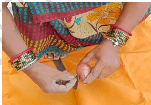
Fig.2: Manual cutting of onion stem and root (sickle)

The manual stem and root cutting of onion shown in Figure 2 is the pillar for the development of this study. The result showed that the cutting capacity of human has a mean of 45 kg/hr shown in Table 1.