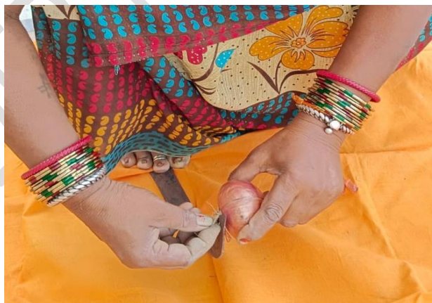
Fig.2: Manual cutting of onion stem and root (sickle)

The manual stem and root cutting of onion shown in Figure 2 is the pillar for the development of this study. The result showed that the cutting capacity of human has a mean of 45 kg/hr shown in Table 1.