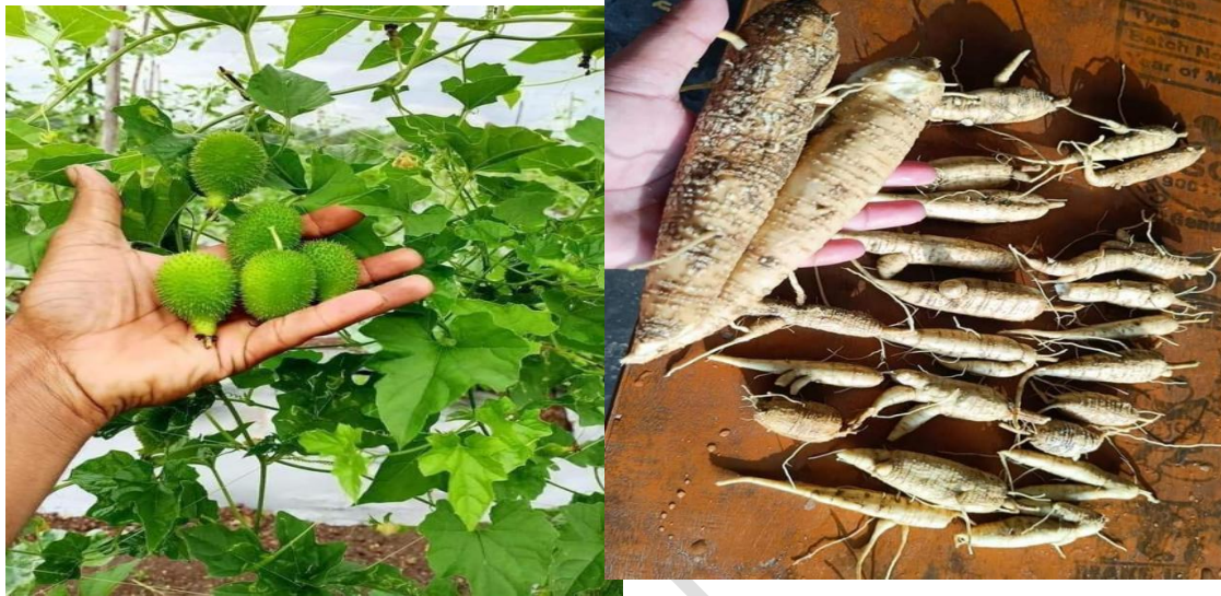
Pic. 1 Images showing cultivation field, fruits and roots of Spine gourd