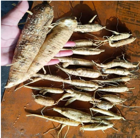
Pic 3. Roots of Spine gourd