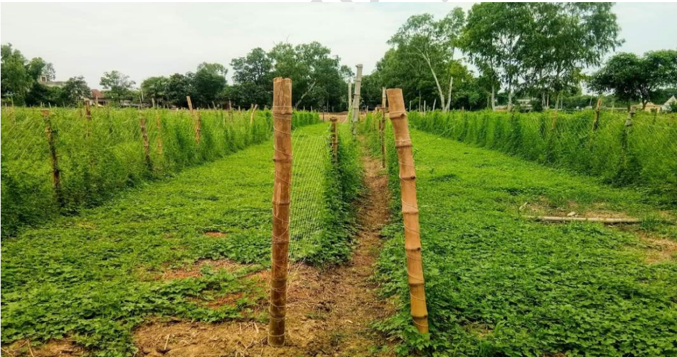
Pic 1.Spine gourd production area

In the bright of the aforesaid critical importance to human health the wide-spread national use this study “Protein and Total Free Amino acid evaluation of improved and local varieties/germplasm of Spine gourd ( Momordica dioica Roxb.)” germplasm receipts remained planned with the following.