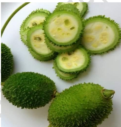
Pic 4. Raw vegetable (Spine gourd)

Maximum total free amino acid content was found NDMD-2 (6.90 mg/100g) in variety followed by Kiron Mala (6.89 mg /100 mg) in variety. Minimum total free amino acid content was found in variety Ambika-13,6 (6.27 mg/100g) followed by