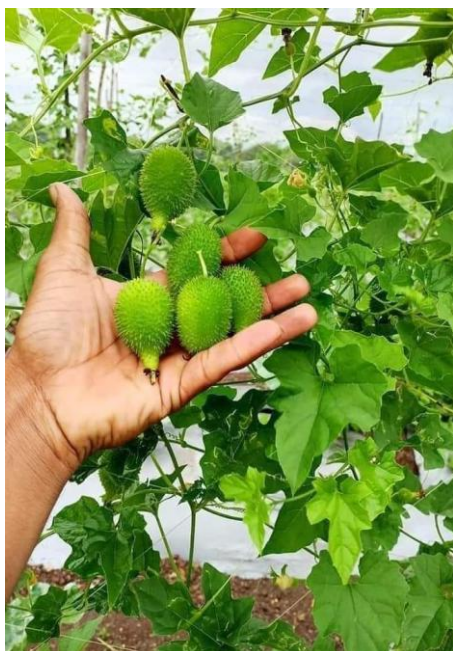
Pic 2. Fruits of Spine gourd