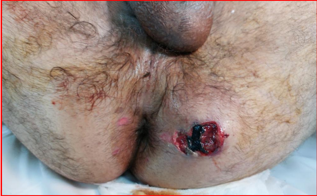
FIGURE 1 : PREOPERATIVE IMAGE SHOWING THE CLINICAL PRESENTATION

Adjacent to this area was a 3cm ulceration with irregular margins and a necrotic fundus leaking pus. On touch, a fixed ulcer-burgeoning process was palpated, located 5 cm from the anal margin.