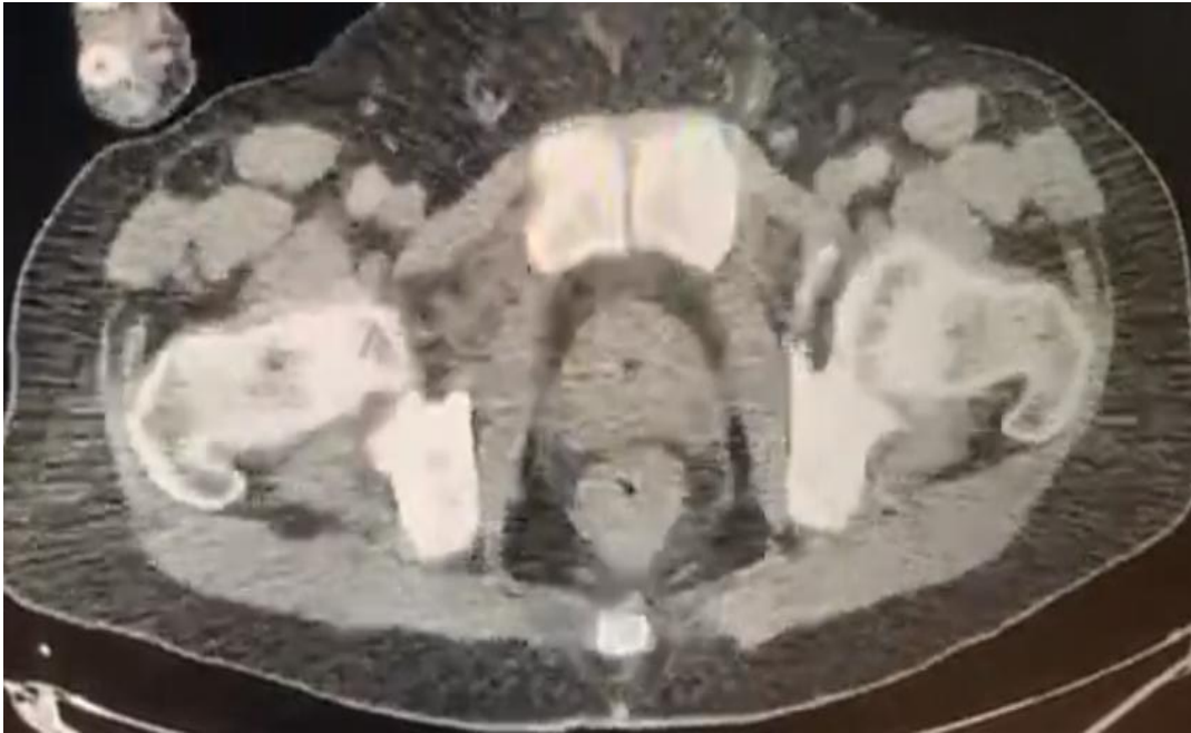
Figure 2 : Axial scan section showing the fistulous path