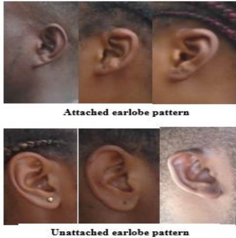
Figure 1 patterns of earlobe attachment