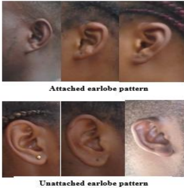
Figure 1 patterns of earlobe attachment