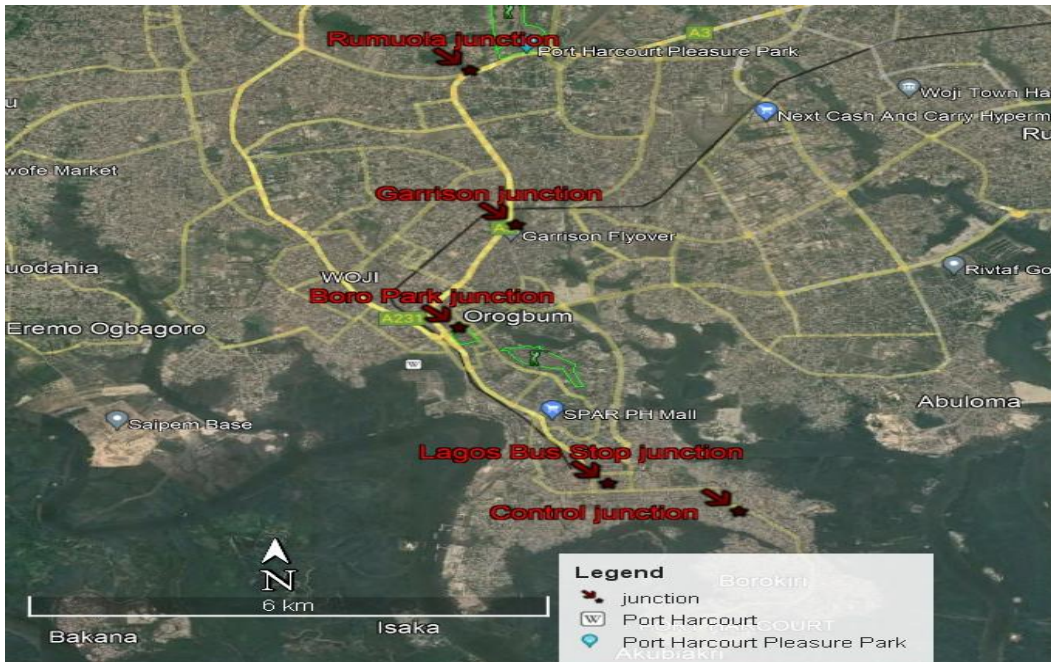
Figure 1: Google map of the study area