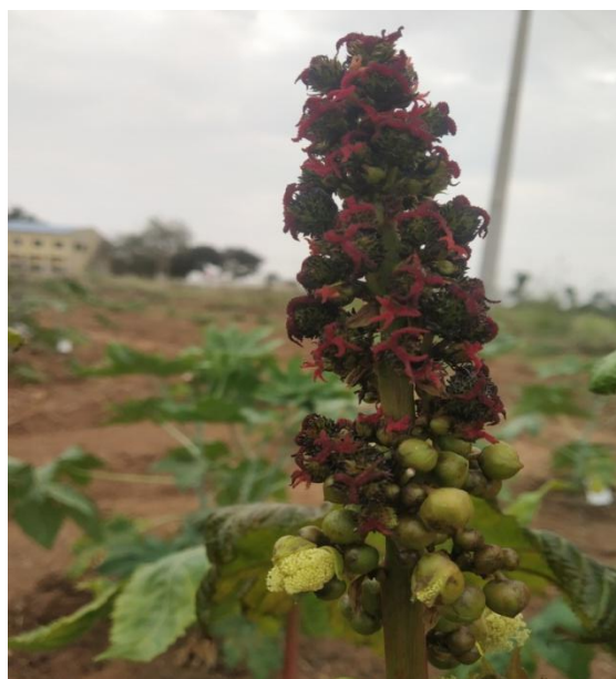
Fig.4. Incidence of thrips on spike during 52 nd SMW