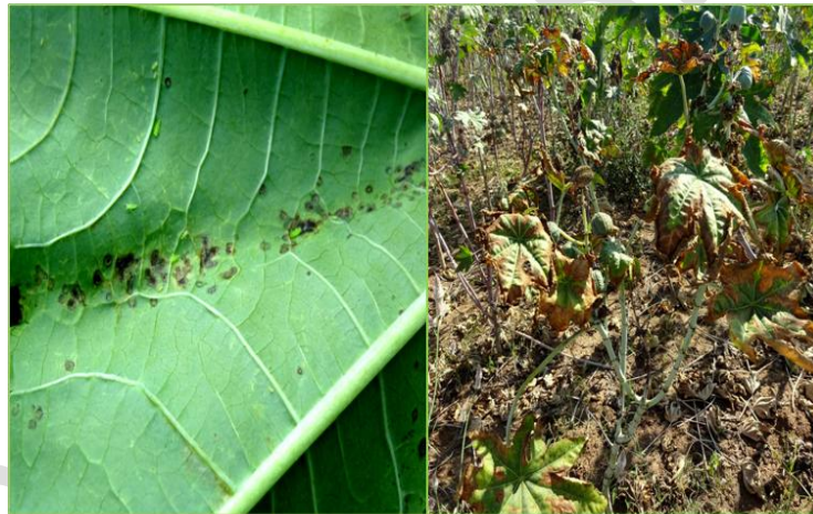
Fig.3. Hopper burn damage caused by leafhopper