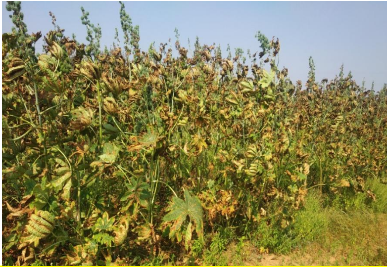
Fig.2. Incidence of leafhopper with hopper burn damage during 52 nd SMW