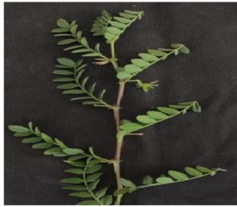
Anthocyanin coloration present