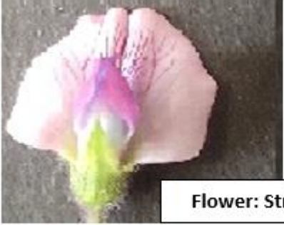
Flower: Strips on standard