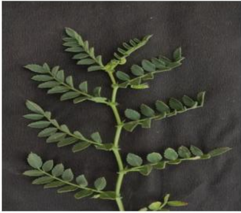
Anthocyanin coloration absent