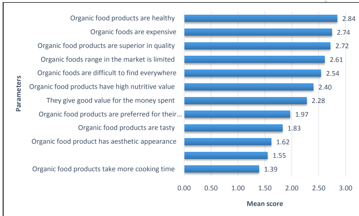
Fig 1: Consumer perception towards organic food products

The information pertaining to the consumer perception towards various organic food products were analysed through 12 statements on a three-point rating scale with scale agreements of agree, neutral, disagree and accordingly scores of 3, 2 and 1 were assigned respectively to the scale agreements. The results are shown in Fig 1