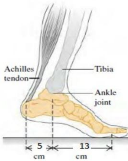
Fig. 2. Feet Muscles Force

The tension on the Achilles tendon T when lifting my body can be obtained by the free- body diagram: