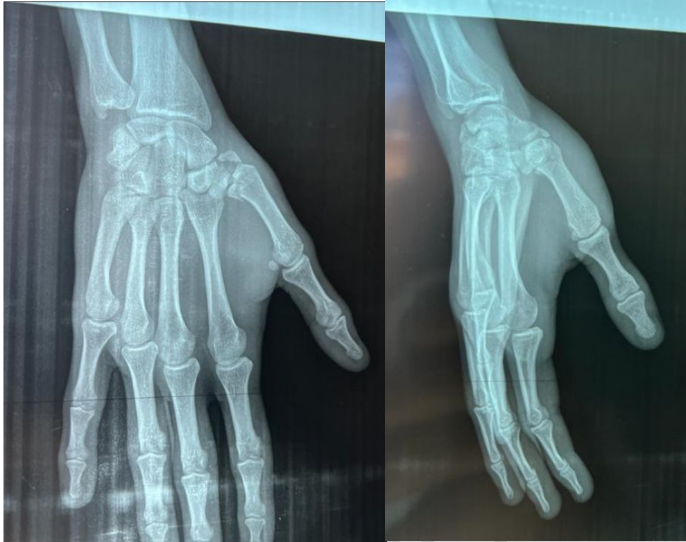
Fig 1: Trapezium fracture associated with a Bennett's fracture