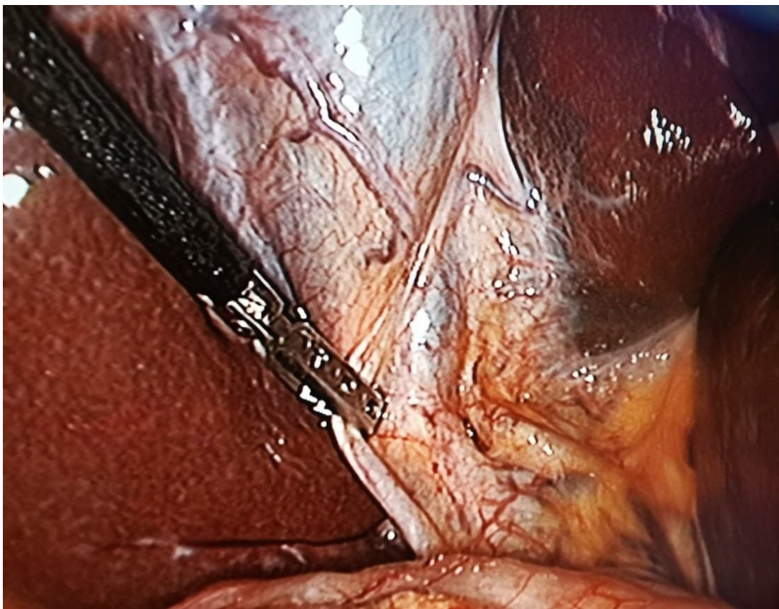
Figure 1: Laparoscopic image of the duplicated cystic duct

The post operative course was uneventful, and the patient was discharged the following day of the surgery.