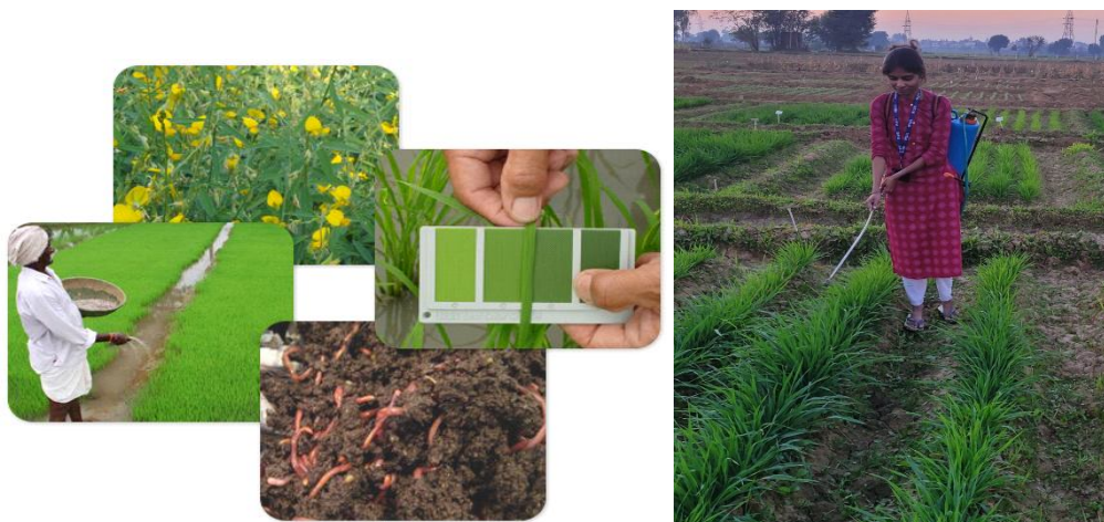
Fig 3: Integrated Nutrient Management approaches

Combined use of organic and inorganic nutrients is essential for increasing fertility of soil, which can reduce the need for expensive and ecologically hazardous fertilisers for the current and following crops (Saikat Biswas et al. , 2019). In addition to supplying organic materials, organic sources such poultry manure (PM), farm yard manure (FYM), compost, green manuring and among others, also improve the soil fertility condition (Chang et al. , 1991;). Manures provide the necessary nutrients and also enhance the chemical and physical characteristics of the soil (Sharpley et al. , 2004.). Chemical fertilisers are an essential component of contemporary crop production techniques. Chemical fertilisers cannot be completely replaced by other methods (NFDC 1997). The combination of inorganic and organic nutrient sources provided necessary nutrients and also had some beneficial interactions with chemical fertilisers to boost their effectiveness and so lowers environmental hazard (Ahmad et al. ,1996). Singh et al. , (2017) performed to evaluate the effect of nutrient management on yield, quality and nutrient uptake of