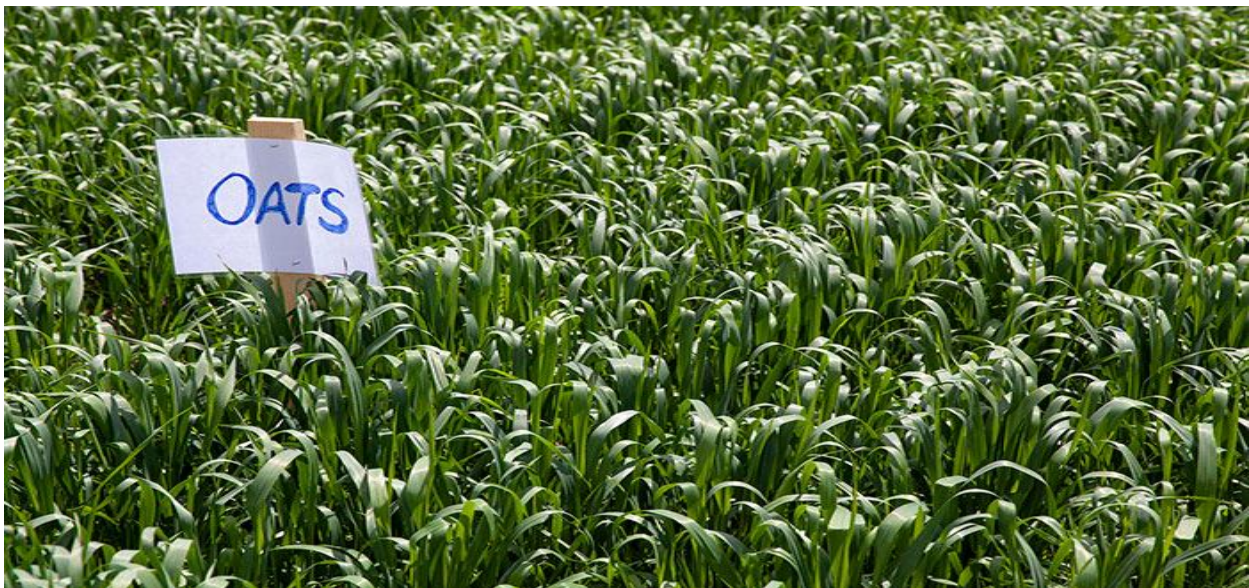
Fig 1: Growth of fodder Oats under different nutrient management

number of benefits, including early availability of fodder, nutritious fodder, high yield potential, palatability, a strong capacity for regeneration and a greater dry matter content. It is an excellent source of calories, protein, iron, phosphorus and vitamin B. Additionally, as a hay oat can be used and silage for feeding animals when there is a shortage of available fodder. Oats can be a cost-effective source of dietary protein because, when managed for cutting from December to April, they produce luscious and extremely tasty fodder (Kumar, 2012). Oats have a lot of potential to increase the quality of the country's available fodder, which will directly enhance the health and milk capacity of milch animals. Additionally, feeding milch animals' high-quality fodder will significantly raise the quality of their milk, which will ultimately enhance human health. In addition, oats are consumed by humans because they yield high-quality grains that may be used to make flooring, oat meal, cookies and other products with a variety of uses. Hence, we are presenting some of the effects of nutrient management on different properties of oat based cropping system.