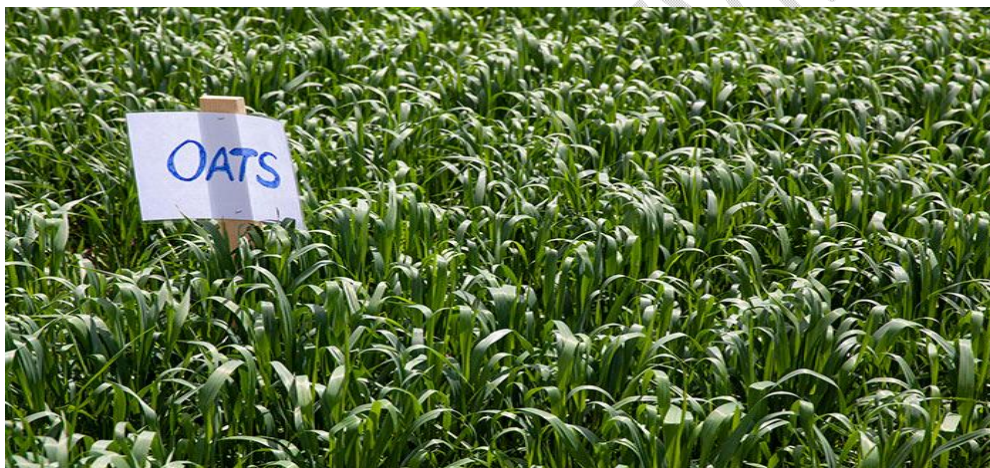
Fig 1: Growth of fodder Oats under different nutrient management

used and silage for feeding animals when there is a shortage of available fodder. Oats can be a cost-effective source of dietary protein because, when managed for cutting from December to April, they produce luscious and extremely tasty fodder (Kumar, 2012). Oats have a lot of potential to increase the quality of the country's available fodder, which will directly enhance the health and milk capacity of milch animals. Additionally, feeding milch animals' high-quality fodder will significantly raise the quality of their milk, which will ultimately enhance human health. In addition, oats are consumed by humans because they yield high-quality grains that may be used to make flooring, oat meal, cookies, and other products with a variety of uses. Hence, we are presenting some of the effects of nutrient management on different properties of oat based cropping system.