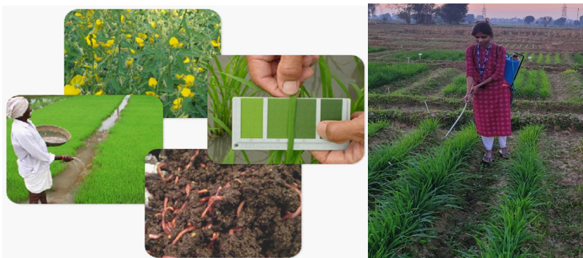
Fig 3: Integrated Nutrient Management approaches