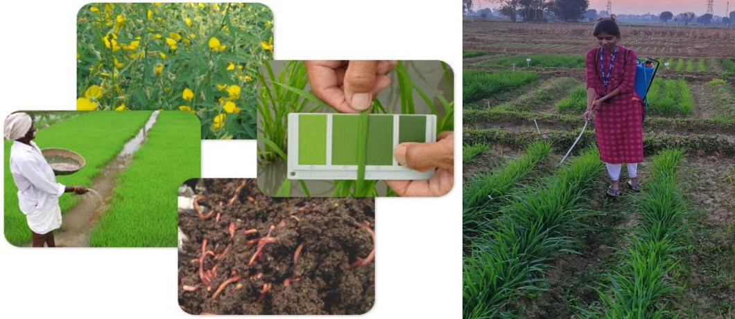
Fig 3: Integrated Nutrient Management approaches