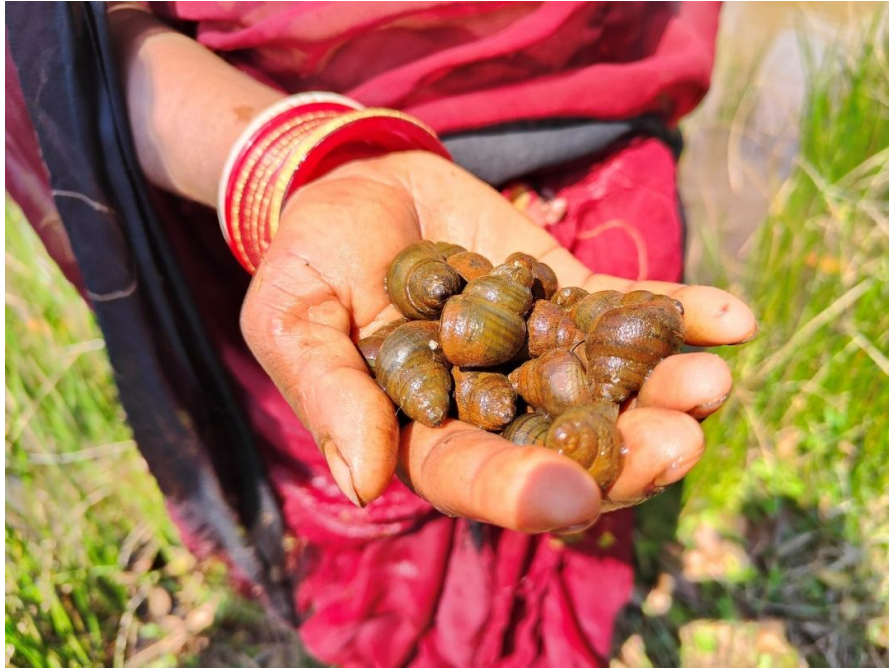
Figure 2: Collected snail by the Munda tribal community