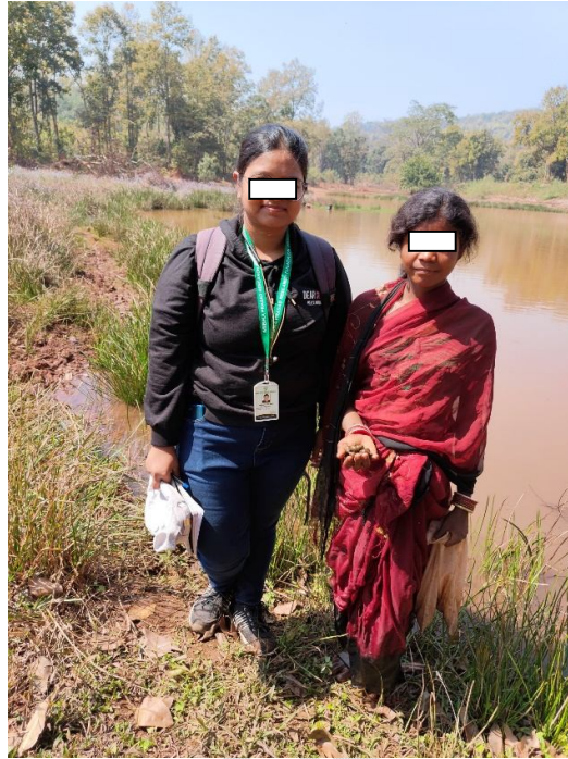
Figure 1: Field survey for the collection of information on snail

A survey was carried out in the selected districts of Odisha (Sundargarh, Mayurbhanj, Cuttack and Keonjhar) in 2023 through a set of questionnaires ( Figure 1 ) and data was collected on food and medicinal uses of Filopaludina bengalensis from different tribal communities.