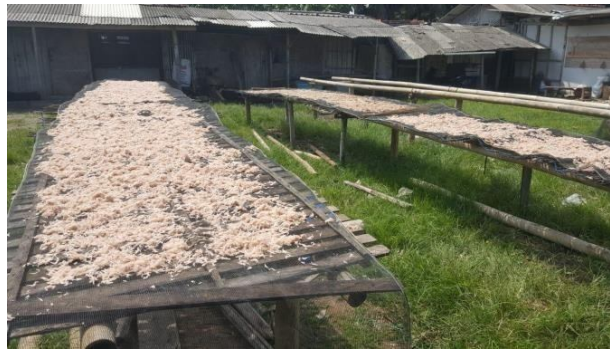
Figure 1. Drying process of rebon shrimp

The next stage after washing is drying. Drying of rebon shrimp in Katapang Doyong field is done through the drying process. The drying technique is as shown in Figure 2. The drying time ranges from 2 - 3 days, depending on weather conditions. Weather factors determine the length of the drying process and determine the quality of the product and the yield of dried shrimp or fish produced (Abustang, NF & Sushanti G, 2022). During the drying process, every 1/2 day, rebon shrimp are stirred to get even drying.