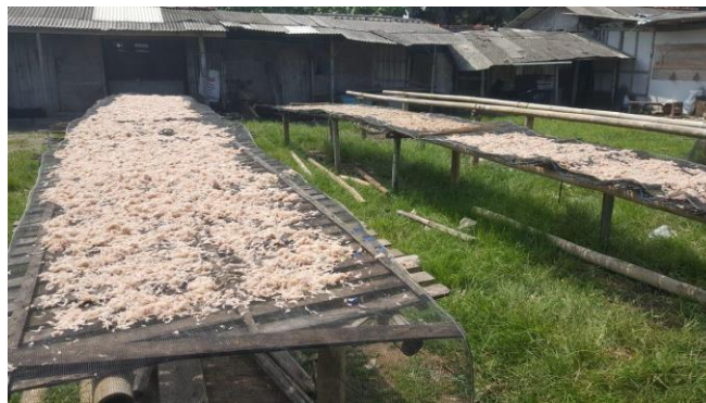
Figure 1. Drying process of rebon shrimp

The next stage after washing is drying. Drying of rebon shrimp in Katapang Doyong field is done through the drying process. The drying technique is as shown in Figure 2. The drying time ranges from 2 - 3 days, depending on weather conditions. Weather factors determine the length of the drying process and determine the quality of the product and the yield of dried shrimp or fish produced (Abustang, NF & Sushanti G, 2022). During the drying process, every 1/2 day, rebon shrimp are stirred to get even drying.