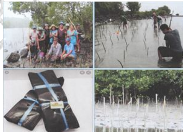
Figure 6. Mangrove planting activities at Barangay San Rafael

Other Coastal Resource Management activities identified and conducted were establishment and maintenance of artificial breeding ground for corals, mangrove nursery and mangrove planting. The coral nursery was established in 2013 while mangrove nursery is continuously maintained at Barangay San Rafael. The Samahan ng Mag-iisda ng Barangay San Rafael was able to plant 100,000 of mangroves or a total of 3 hectares mangrove plantation using Rhizophora species.