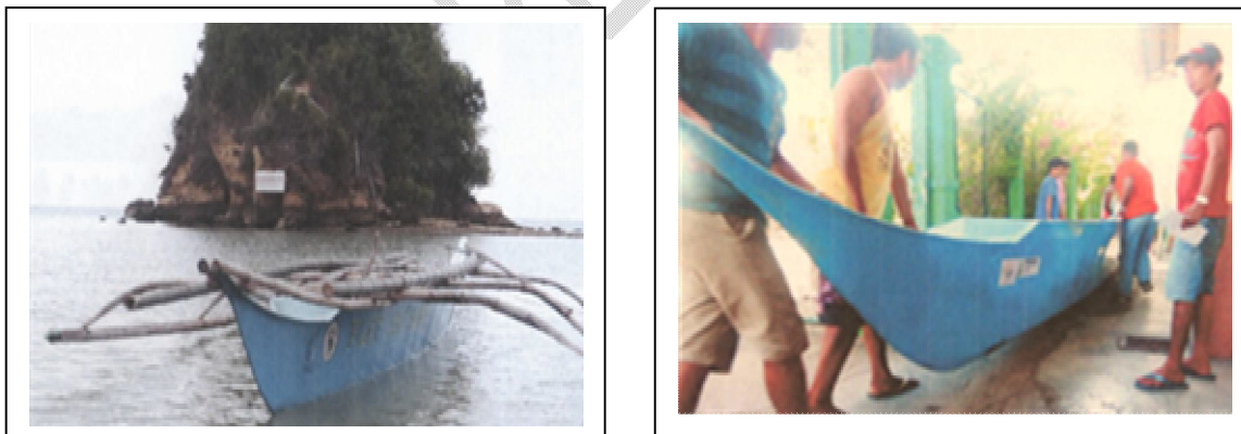
Figure 4. Patrol boats granted/ provided for patrolling and regulation activities of the FLET

According to FLET members/bantay dagat, they have five (5) boats being used in the patrolling/ surveillance and regulation activities in the eight coastal barangays. Four (4) of these were from the local government while the other one was granted by BFAR under the FishCORAL Project. These boats are likewise provided with essential supplies for the patrolling activities. Maintenance and gasoline expenses are regularly provided by the local government to make these double engine patrol boats fully operational. However, the local government decided to designate one of these boats for activities related to tourism purposes.