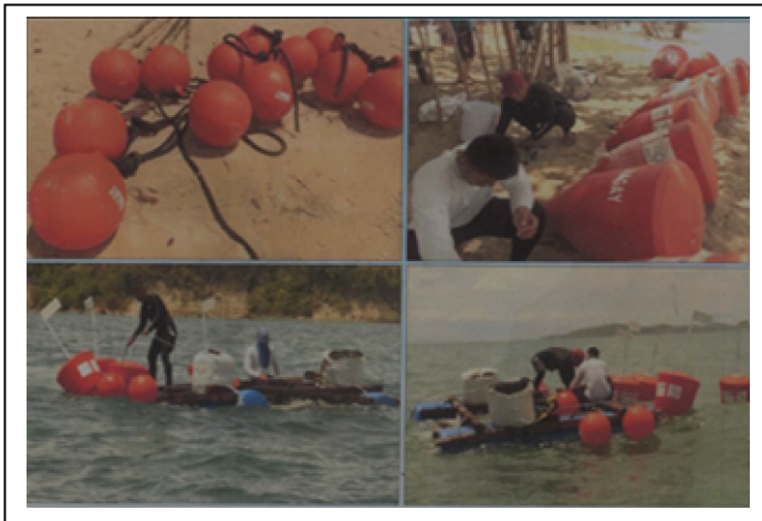
Figure 2. The orange buoy markers installed in the Marine Reserve and Fish Sanctuary at Sitio Ogtoc, Barangay Buenasuerte

All of the respondents were aware of the CRM initiatives being implemented by the Local Government Unit of Ragay, particularly the existence of fish sanctuary or marine protected area, watch tower, bantay dagat, and patrol boat. Twenty-four (24) respondents were aware that radio communication equipment is available and these were primarily being used by the FLET members or Bantay Dagat in their surveillance and apprehension activities.