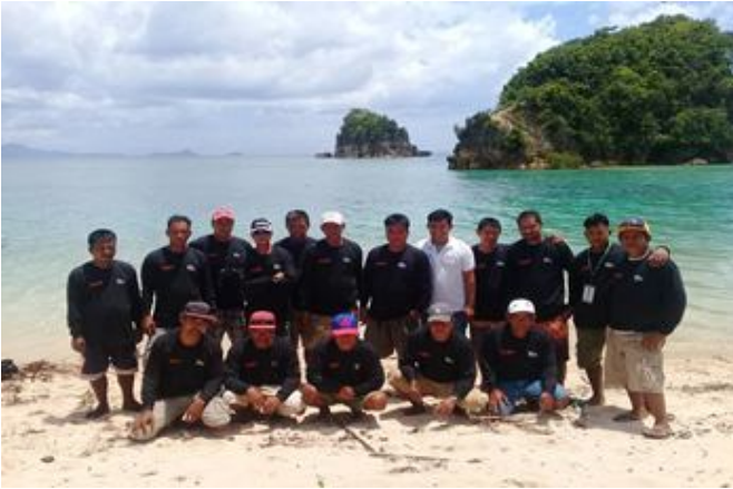
Figure 5. The FLET members (bantay dagat) from the 8 coastal barangays

Presently, there are twenty (20) FLET members trained by BFAR and deputized by the local government. All of the 8 coastal barangays have active bantay dagat. According to Chief Bantay Dagat, the group of bantay dagat was organized and operating since 1996. However, officials and fisherfolks from Binahan Proper and Buensuerte responded that FLET/bantay dagat have been existing since 1980s.