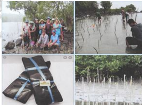
Figure 6. Mangrove planting activities at Barangay San Rafael

Other Coastal Resource Management activities identified and conducted were establishment and maintenance of artificial breeding ground for corals, mangrove nursery and mangrove planting. The coral nursery was established in 2013 while mangrove nursery is continuously maintained at Barangay San Rafael. The Samahan ng Mag-iisda ng Barangay San Rafael was able to plant 100,000 of mangroves or a total of 3 hectares mangrove plantation using Rhizophora species.