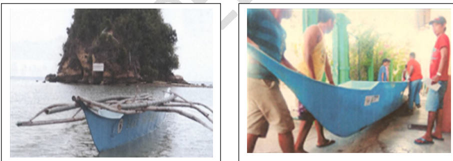
Figure 4. Patrol boats granted/ provided for patrolling and regulation activities of the FLET

According to FLET members/bantay dagat, they have five (5) boats being used in the patrolling/ surveillance and regulation activities in the eight coastal barangays. Four (4) of these were from the local government while the other one was granted by BFAR under the FishCORAL Project. These boats are likewise provided with essential supplies for the patrolling activities. Maintenance and gasoline expenses are regularly provided by the local government to make these double engine patrol boats fully operational. However, the local government decided to designate one of these boats for activities related to tourism purposes.