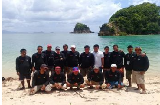
Figure 5. The FLET members (bantay dagat) from the 8 coastal barangays

Presently, there are twenty (20) FLET members trained by BFAR and deputized by the local government. All of the 8 coastal barangays have active bantay dagat. According to Chief Bantay Dagat, the group of bantay dagat was organized and operating since 1996. However, officials and fisherfolks from Binahan Proper and Buensuerte responded that FLET/bantay dagat have been existing since 1980s.