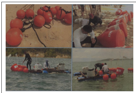
Figure 2. The orange buoy markers installed in the Marine Reserve and Fish Sanctuary at Sitio Ogtoc, Barangay Buenasuerte

All of the respondents were aware of the CRM initiatives being implemented by the Local Government Unit of Ragay, particularly the existence of fish sanctuary or marine protected area, watch tower, bantay dagat, and patrol boat. Twenty-four (24) respondents were aware that radio communication equipment is available and these were primarily being used by the FLET members or Bantay Dagat in their surveillance and apprehension activities.