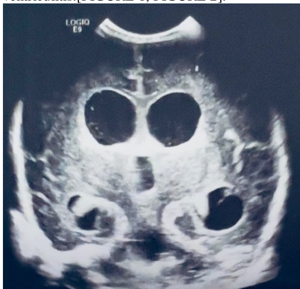
FIGURE 1: TRANSFONTANELLAR ULTRASOUND CORONAL SECTION

Trans-fontanelar ultrasound revealed moderate tetraventricular hydrocephalus with signs of ventriculitis.[FIGURE 1, FIGURE 2].