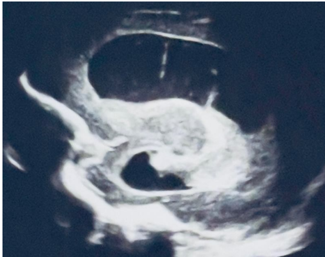
FIGURE 2: TRANSFONTANELLAR ULTRASOUND SAGITAL SECTION

A cerebral computed tomography showed active major tetra-ventricular hydrocephalus associated with ventriculitis. [FIGURE 3].