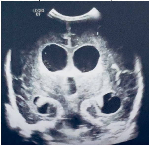
FIGURE 1: TRANSFONTANELLAR ULTRASOUND CORONAL SECTION

Trans-fontanelar ultrasound revealed moderate tetraventricular hydrocephalus with signs of ventriculitis. [FIGURE 1, FIGURE 2].