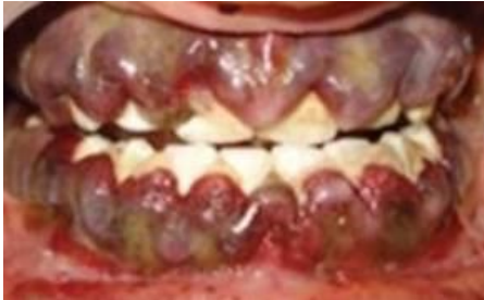
Fig.4 Worsening of gingival enlargement

Additionally, the clinical appearance of the oral lesions worsened. There were formations of crevices at the junction of enlarged gingivae and adjoining tooth surfaces (Fig 4). The gingival enlargements almost reached the occlusal surfaces of the teeth and interfered with mastication. On the dorsum of tongue as well as the labial, buccal and palatal mucosae, numerous petechiae and ulcerations indicative of mucositis were noticed. These debilitating lesions did not resolve and further incapacitated the patient. During course of medical treatment, patient succumbed to the disease due to respiratory arrest.