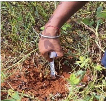
(e) Pod zone depth