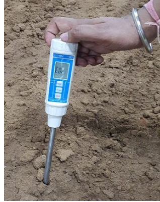
(a) Measurement of soil moisture content in the experimental field