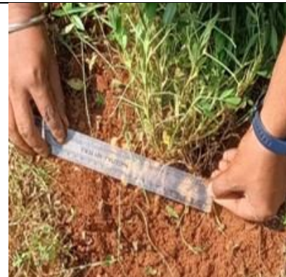
(f) Pod spreading diameter