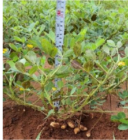
(b) Plant height