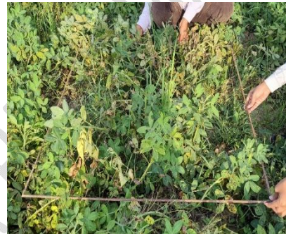
(d) Plant population