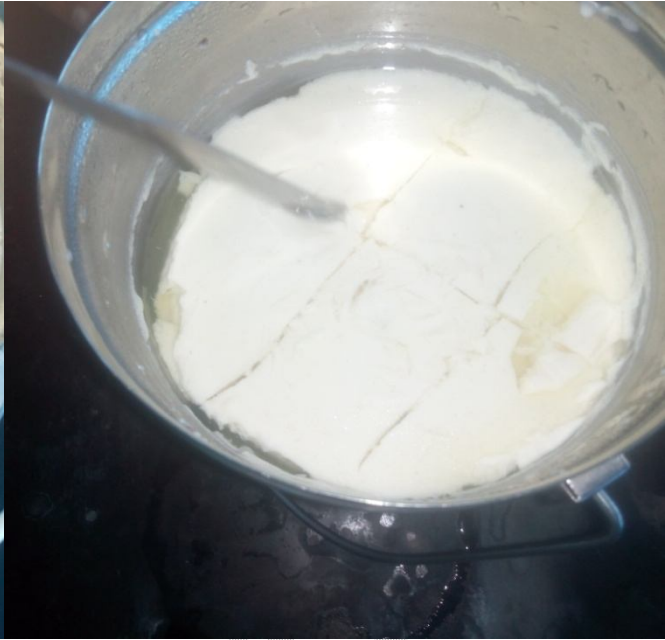
Figure 2. Squarely cut of curd