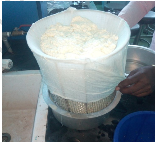
Figure 4. Cheese Made from 50:50%