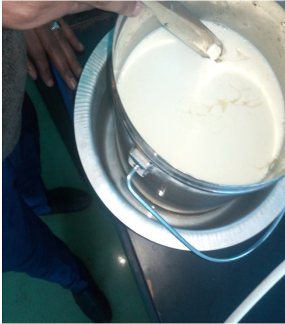
Figure 1. Curd Formed