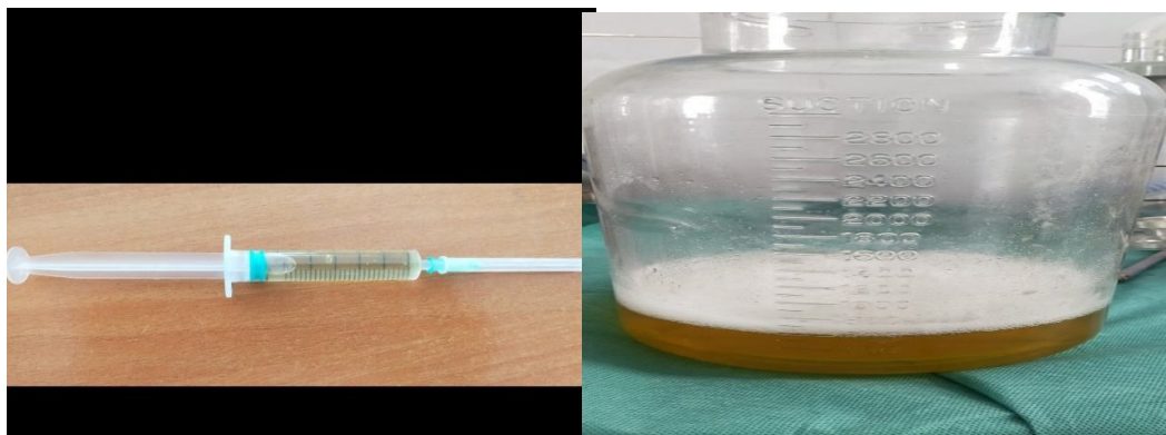
Figure 3 :Clear yellow appearance of pericardial fluid after pericardiocentesis