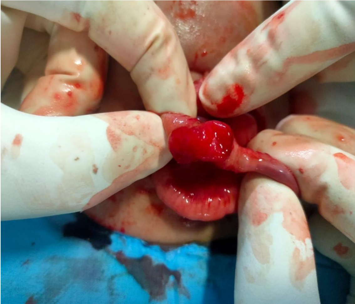
Fig. 5 A patent urachus