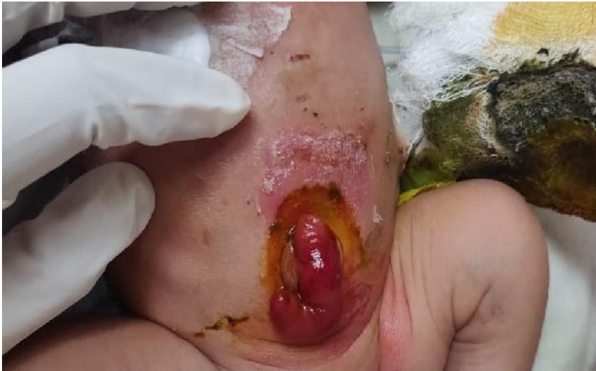
Fig.2 Operative condition