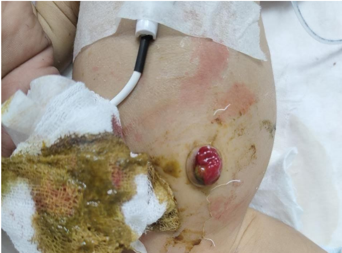
Fig. 1. soft ,distended pinkish umbilical mass with greenish discharge from umbilical stump.

Local Examination: PA: soft ,distended pinkish umbilical mass+ with greenish discharge from umbilical stump.