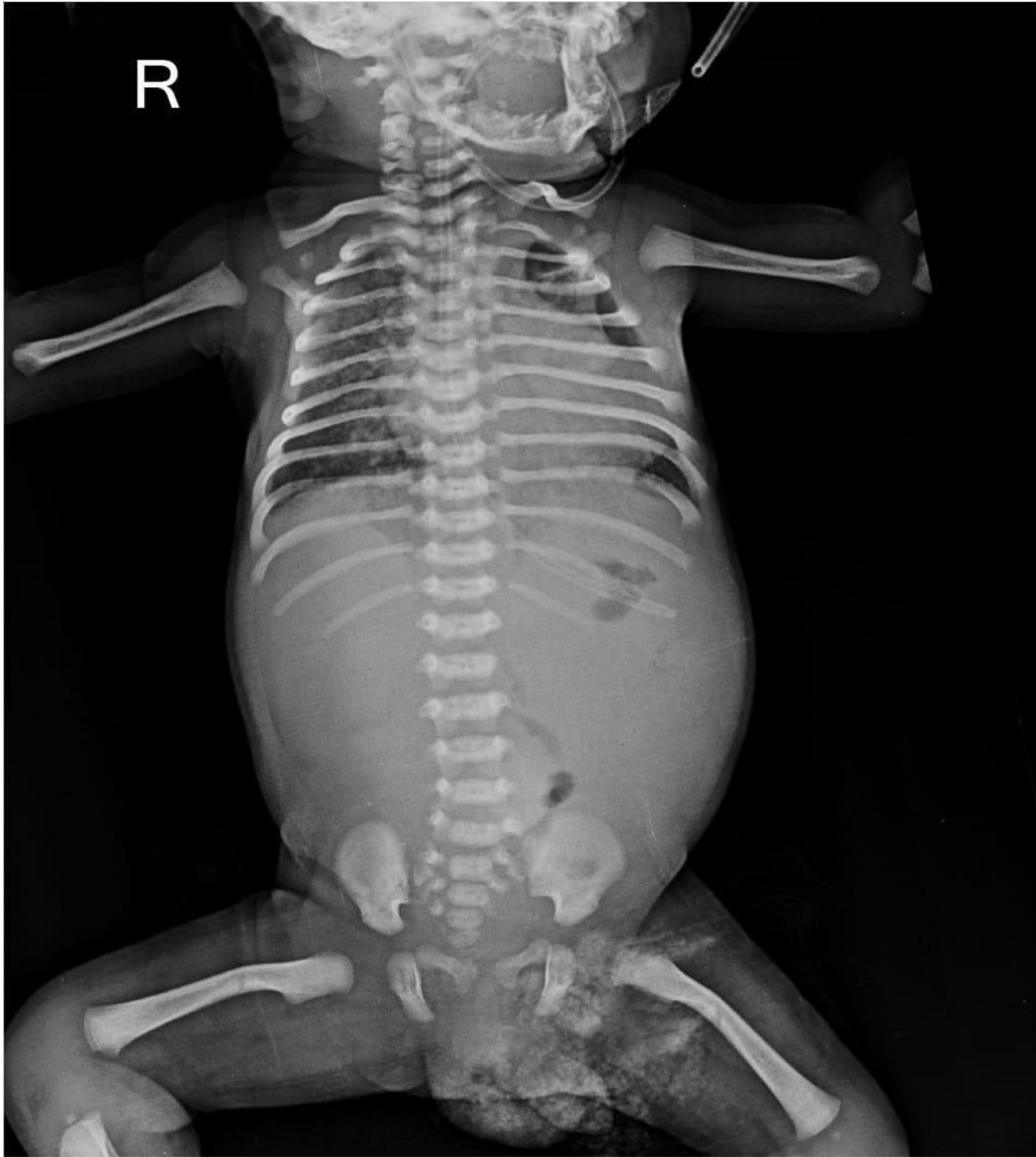
Fig. 3. X-Ray Chest AP view