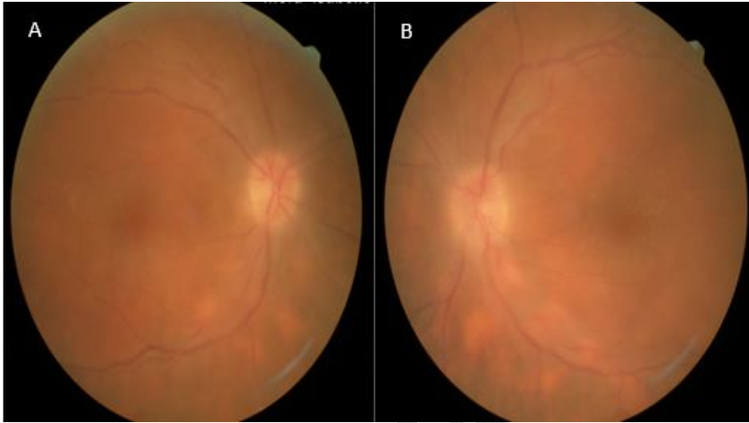
Figure 1: Retinography of both eyes with bilateral papilledema with yellowish oval spots. A: right eye /B: left eye