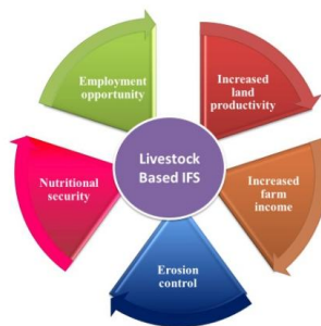
Fig 2. Advantages of Livestock based IFS

The advantages of livestock crop integration are in the following perspectives: (a) Agronomical (b) Economical (c) Ecological (d) Nutritional and (e) Social. Plants and livestock interact to create synergy (34).