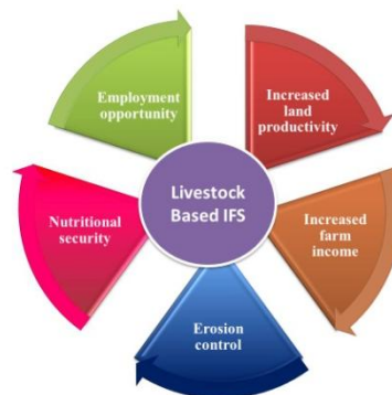
Fig 2. Advantages of Livestock based IFS

The advantages of livestock crop integration are in the following perspectives: (a) Agronomical (b) Economical (c) Ecological (d) Nutritional and (e) Social. Plants and livestock interact to create synergy (34).