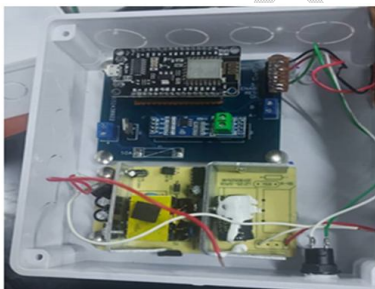
Fig. 5: An Assembled IoT Controller Module

To enhance reliable system operations in every power station where the IoT was deployed the following steps were carried out: