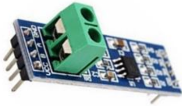
Fig. 3: A Communication Card

The communication card used in the controller is RS485 card (fig.3). RS485 to TTL Module (supporting EIA-485 standard) is for long range, high data rate error prone differential communication. Digital