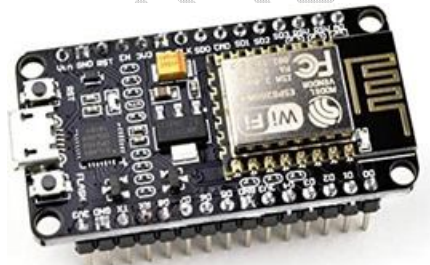
Fig. 2: A Wireless Module

ESP8266 (fig. 2) (also called ESP8266 Wireless Transceiver) is a cost-effective, easy-to-operate, compact-sized & low powered WiFi module, designed by Espressif Systems, supports both TCP/IP and Serial Protocol [6]. It's normally used in IOT cloud based embedded projects and is