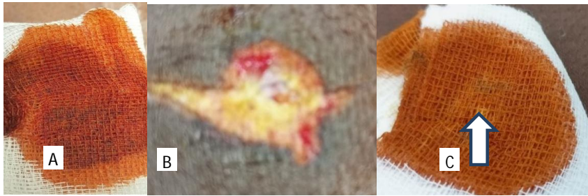
Fig1: Discolouration test of the pad (A) through the bullet entry point (B) shown by an arrow (c)

A lumbar CT scan was performed showing a fracture of the D8 lamina with a large fragment under the upper shelf of the vertebral body of intra canal bone and a bullet in the vertebral body of D8 (fig2) with integrity of the anterior wall of the spine.