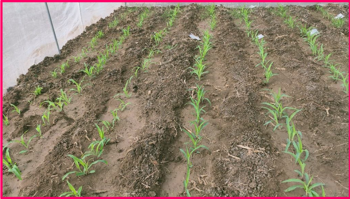
Fig.2: Genotypes in screen house