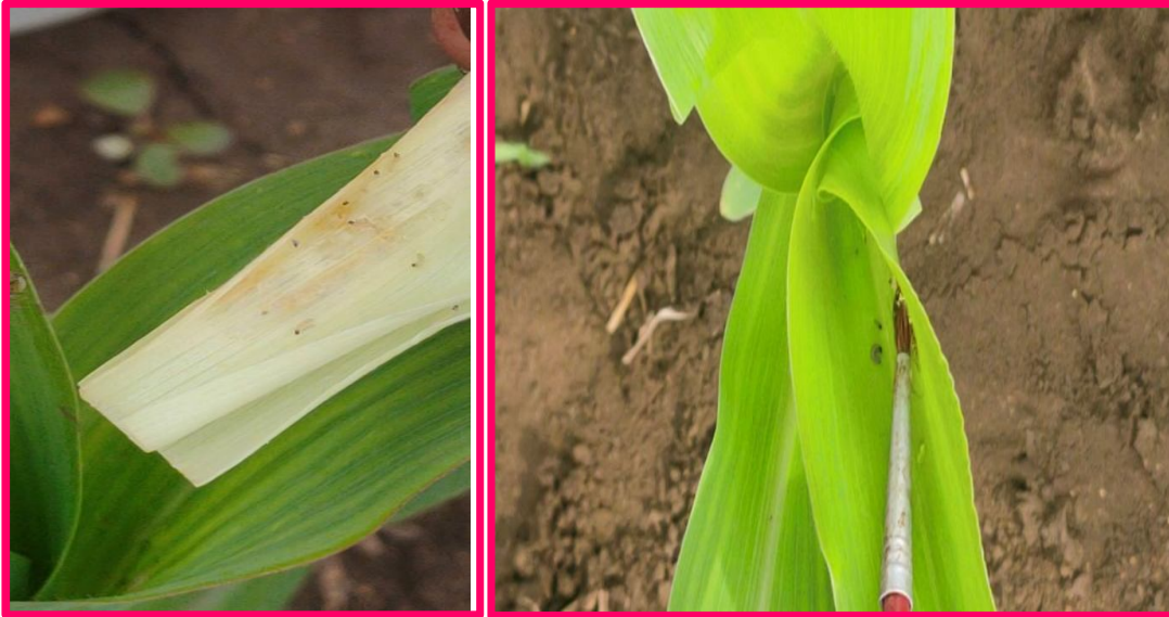
Fig.4: Artificial release of FAW neonates at V5 stage of the maize genotypes with the help of camel hairbrush