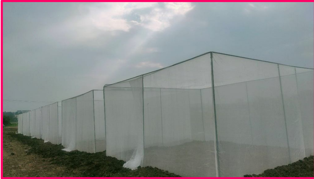
Fig.1: Screen houses for screening of genotypes