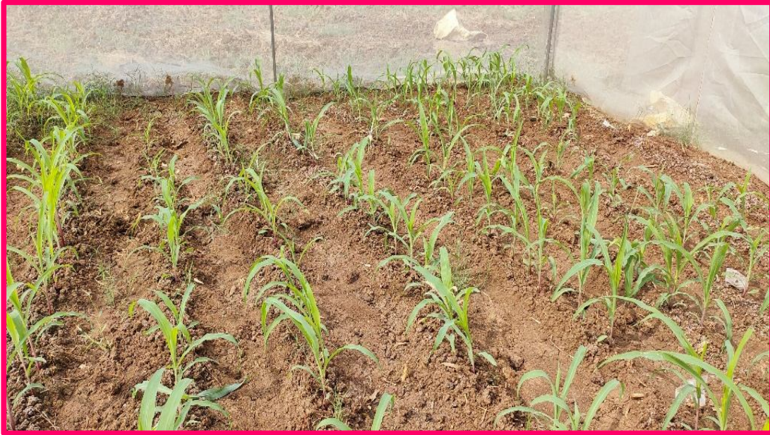
Fig.3: V5 stage of maize genotypes