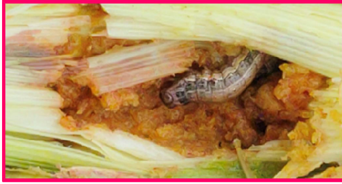
Fig.6: Ear Damage