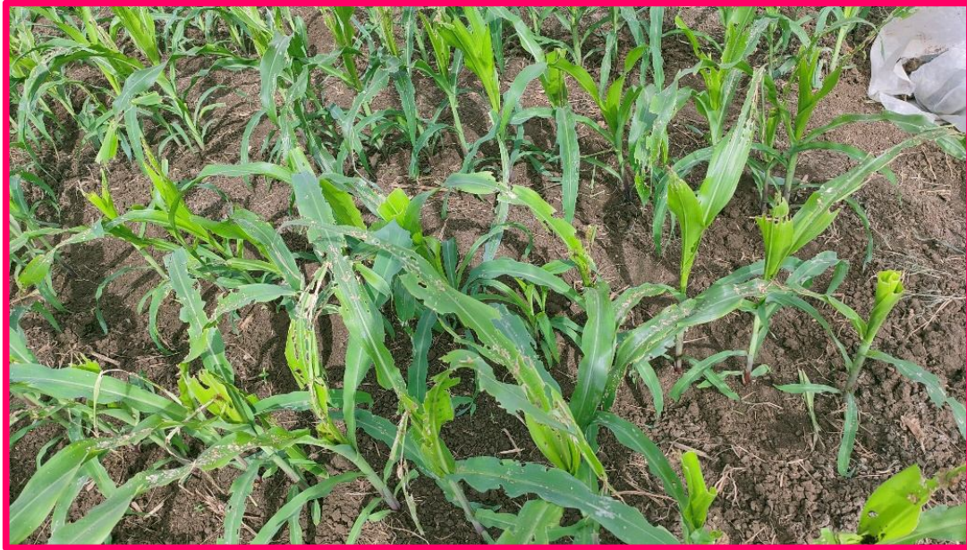
Fig.5: Leaf Injury Rating (LIR) at V7 stage