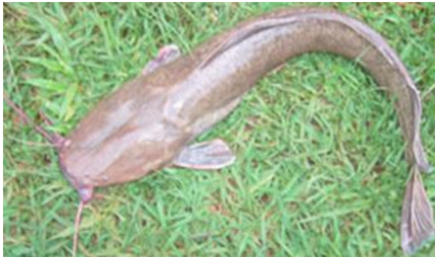
Figure 1: Fresh Clarias gariepinus (Catfish)

employing millions of citizens. The availability of food in the ecosystem, fertilization, feed composition, feeding rates, aquatic environment water quality, and, of course, the method of processing and preservation all have an impact on fish quality, which is an important factor in the fish supply value chain [4]. Fish is subjected to various processing methods including cooking, canning, drying (electric and non-electric), smoking and freezing. Proteins, fats, vitamins, minerals, and sensory qualities like color, flavor, texture, and overall appearance are the most important components of fish that can be altered by processing methods. The treatment temperature and duration determine the extent of these changes. The final quality of fish and fishery products is impacted by all of these changes, including chemical, physical, and nutritional factors [1]. In a study Al-Reza et al. [5] showed that sun drying, smoking, freezing, and canning affected the proximate, biochemical, and microbiological characteristics of fish.