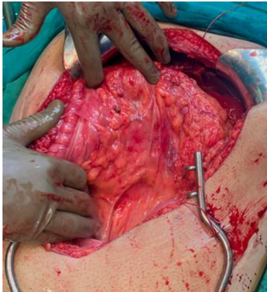
Fig. 4. Adhesion of Viscera to Mass