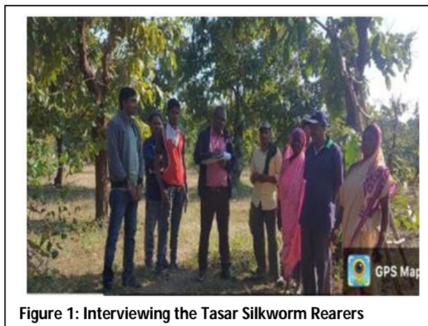
Figure 1: Interviewing the Tasar Silkworm Rearers

For studying the general perception of tasar silkworm rearers about the climate change, Climate Change Perception Index (CCPI) was developed. The index contained 10 statements on 3 point continuum Likert Scale i.e. Agree, Undecided and Disagree. Similarly, Climate Change Impact Perception Index (CCIFI) was used to assess the perception about the impact of climate change on tasar silkworm rearing performance. Respondents were asked to score the Climate Change Impact Perception Index based on 3 point continuum Likert Scale. The scale contained 10 (positive and negative) statements. For positive statements scoring was done Increased-03, Unchanged-2, and Decreased-01 and for negative statement the scoring was Decreased-03, Unchanged-02 and Increased-01. Weighted Average Index (WAI) was used to analysis the impact with the following formula;