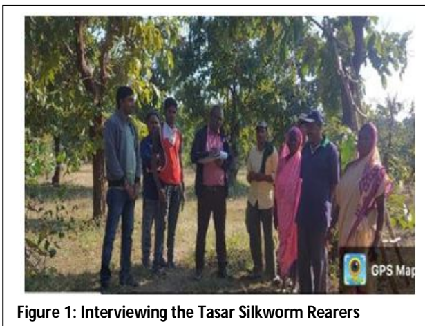
Figure 1: Interviewing the Tasar Silkworm Rearers

The index contained 10 statements on 3 point continuum Likert Scale i.e. Agree, Undecided and Disagree. Similarly, Climate Change Impact Perception Index (CCIPI) was used to assess the perception about the impact of climate change on tasar silkworm rearing performance. Respondents were asked to score the Climate Change Impact Perception Index based on 3 point continuum Likert Scale. The scale contained 10 (positive and negative) statements. For positive statements scoring was done Increased-03, Unchanged-2, and Decreased-01 and for negative statement the scoring was Decreased-03, Unchanged-02 and Increased-01. Weighted Average Index (WAI) was used to analysis the impact with the following formula;