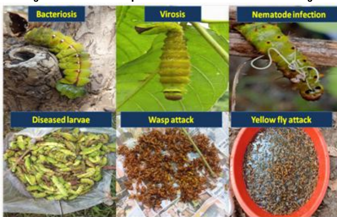
Figure 2: Disease and pests outbreaks due to climate change

The data presented in the Table 3 and Fig.3 reveals that majority of the tasar silkworm rearers perceived that the cocoon production & yield in last ten years has been decreases and ranked first with the WAI of 2.81. They also agreed with the fact that the frequency of loss of tasar rearing due to climate change has been increased over the period. It has got WAI of 2.76. They also revealed that the frequency of disease incidence is increased and ranked it as 3 rd major factors in the impact of climate change on the rearing rearing. It has received the WAI of 2.71. Further, the income from tasar silkworm rearing has perceived to be decreased, while mortality of final stage larvae of silkworm, frequency of pests and predators incidence, hatching problem in dfls during first crop have perceived to be increased by the majority of the tasar silkworm reares