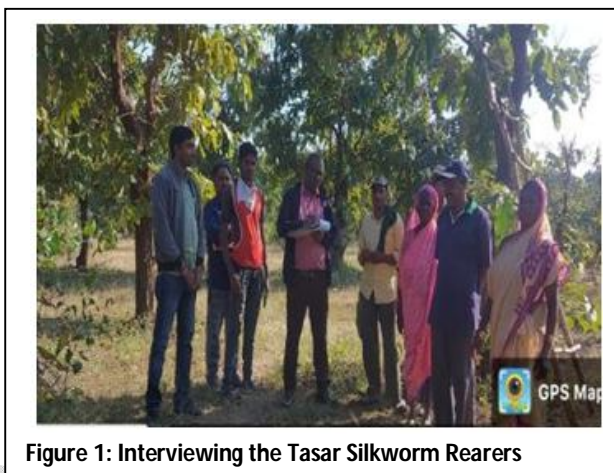
Figure 1: Interviewing the Tasar Silkworm Rearers

For studying the general perception of tasar silkworm rearers about the climate change, Climate Change Perception Index (CCPI) was developed. The index contained 10 statements on 3 point continuum Likert Scale i.e. Agree, Undecided and Disagree. Similarly, Climate Change Impact Perception Index (CCUPI) was used to assess the perception about the impact of climate change on tasar silkworm rearing performance. Respondents were asked to score the Climate Change Impact Perception Index based on 3 point continuum Likert Scale. The scale contained 10 (positive and negative) statements. For positive statements scoring was done Increased-03, Unchanged-2, and Decreased-01 and for negative statement the scoring was Decreased-03, Unchanged-02 and Increased-01. Weighted Average Index (WAI) was used to analysis the impact with the following formula;