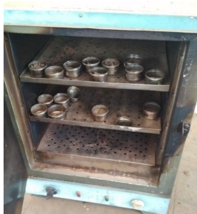
Fig. 1. Soil moisture content measurement by oven drying method