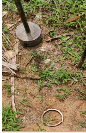
Fig. 2. Soil bulk density measurement by core cutter method

gauge was noted for different depths. The cone index was measured from 2.5 to 12.5 cm depth and recorded manually.