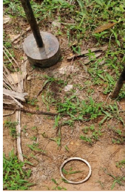
Fig. 2. Soil bulk density measurement by core cutter method

on the handle and deflection of dial gauge was noted for different depths. The cone index was measured from 2.5 to 12.5 cm depth and recorded manually.