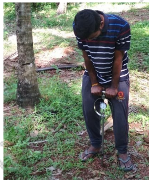
Fig. 3. Soil cone index measurement by cone penetrometer