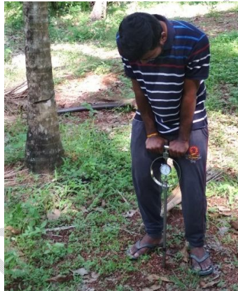
Fig. 3. Soil cone index measurement by cone penetrometer