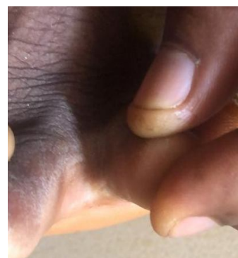
Fig 3A : Before treatment