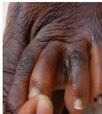
Fig 2A : Before treatment