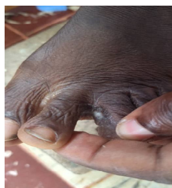
Fig 1A : Before treatment