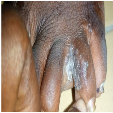
A : Before treatment