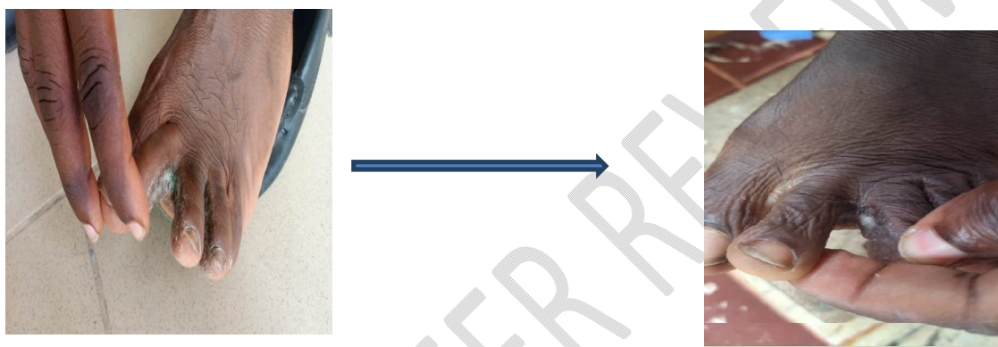
A : Before treatment

-Subject A, 28 years old, had feet fungus disease of the intertrigo-inter toe form at the maceration stage which affected the three (3) inter-toe spaces. Indeed, we observed lesions and pearly white parts in the bottom of the interdigital spaces covered with a crumpled and macerated epidermis with thicker and wet scales. After one week of treatment with the extract, we noticed the disappearance of the lesions and the wet scales leaving a dry epidermis. The subject A is cured forty (40) days of treatments (figure 1).