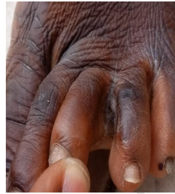
A : 5 days after treatment