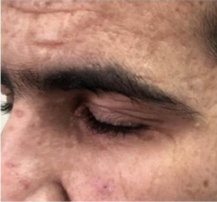
Figure 3: Typical beaded papules occur on the eyelid margins "moniliform blepharosis"