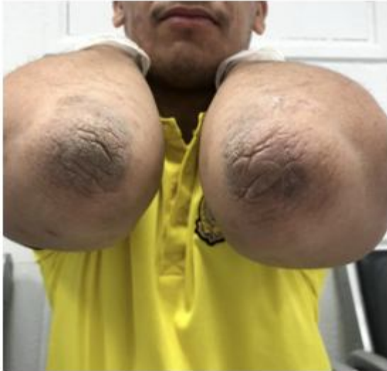
Figure 4: Elbows developed verrucous hyperkeratotic plaques