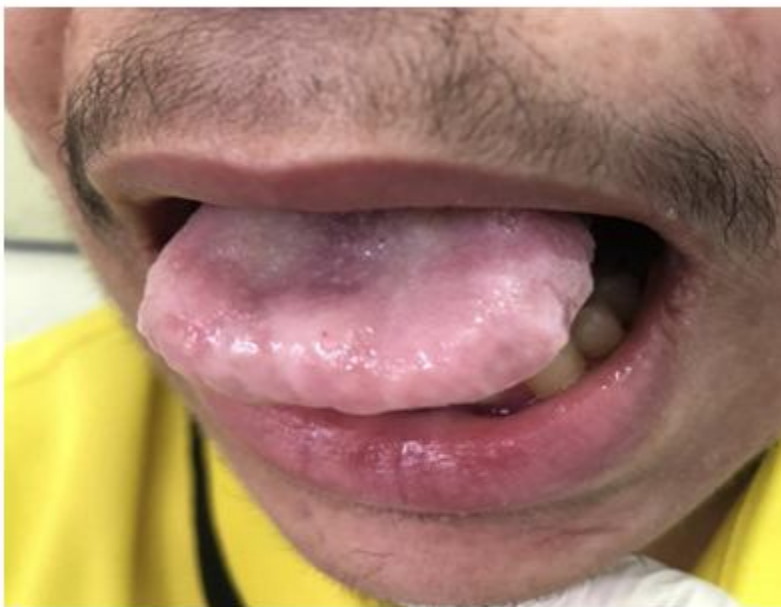
Figure 2: Difficulty in tongue protrusion