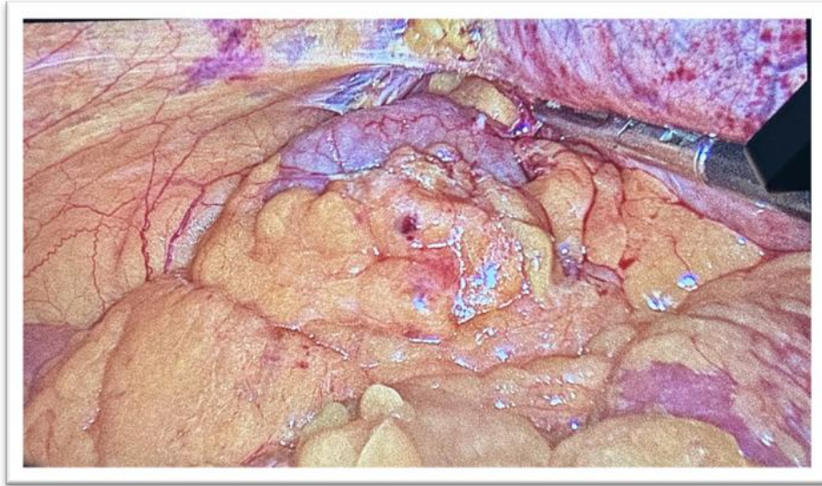
Fig. 2. Intraoperative image showing a cyst deriving from the mesentery at a distance from right colonic