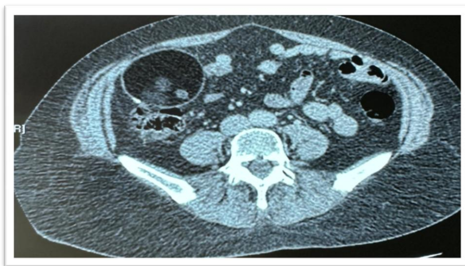
Fig. 1. Abdominal CT scan showed a thin-walled mesenteric cystic lesion (with a few calcifications), with highly hypodense content (measured fatty density of 170 HU) and an intracystic, hypo-dense, sloping formation measuring 72mm x 71mm in the infrahepatic region

Peritoneal mesothelial or mesenteric cysts (PMC) are very rare benign tumors that mostly occur in young individuals and rarely in older ones [6]. These cysts can occur at any part of the gastro intestinal mesentery but are predominantly localized with 60% preference in the small bowel mesentery, 24% throughout the colonic flexure, 14.5% in the retroperitoneum, and 1.5% of unknown cause [7]. asymptomatic in 50% of cases [10]. They can be discovered during an etiological assessment carried out for another pathology. Symptoms range from mild abdominal pain (82%) and nausea and vomiting (45%) to constipation (27%), abdominal distension (61%), and palpable mass (44%) [11]. However, they can reach extreme sizes, presenting with intestinal obstruction, abdominal deformity, peritonitis by cyst perforation, or compression of adjacent organs [12]. Some authors suggest that these symptoms occur when the size of the cyst exceeds 5 cm [13].