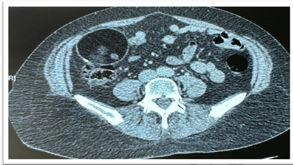
Figure 1: Abdominal CT scan showed a thin-walled mesenteric cystic lesion (with a few calcifications), with highly hypodense content (measured fatty density of 170 HU) and an intracystic, hypo-dense, sloping formation measuring 72mm x 71mm in the infrahepatic region.