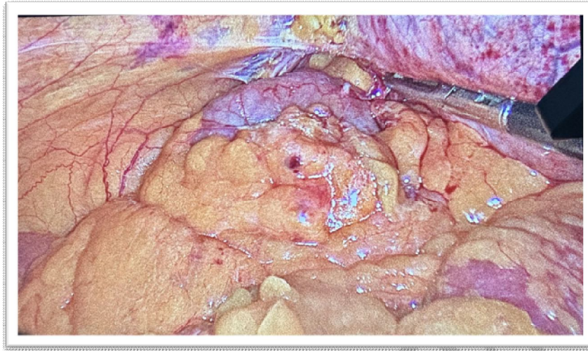
Figure 2: Intraoperative image showing a cyst arising from the mesentery at a distance from the right colonic